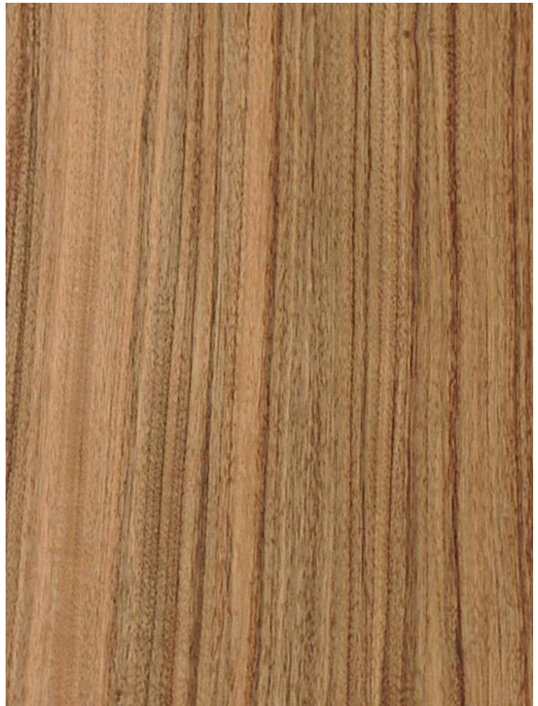
ABOVE: QUARTERED PLAIN AUSTRALIAN WALNUT. BELOW LEFT: AUSTRALIAN WALNUT IN A SLIP MATCH. BELOW RIGHT: AUSTRALIAN WALNUT IN A BOOK MATCH.

Visit our website today for this and more species in our extensive veneer library. Contact us to receive a live sample, panel, or ask any other questions you may have on your project. (616) 698-6450