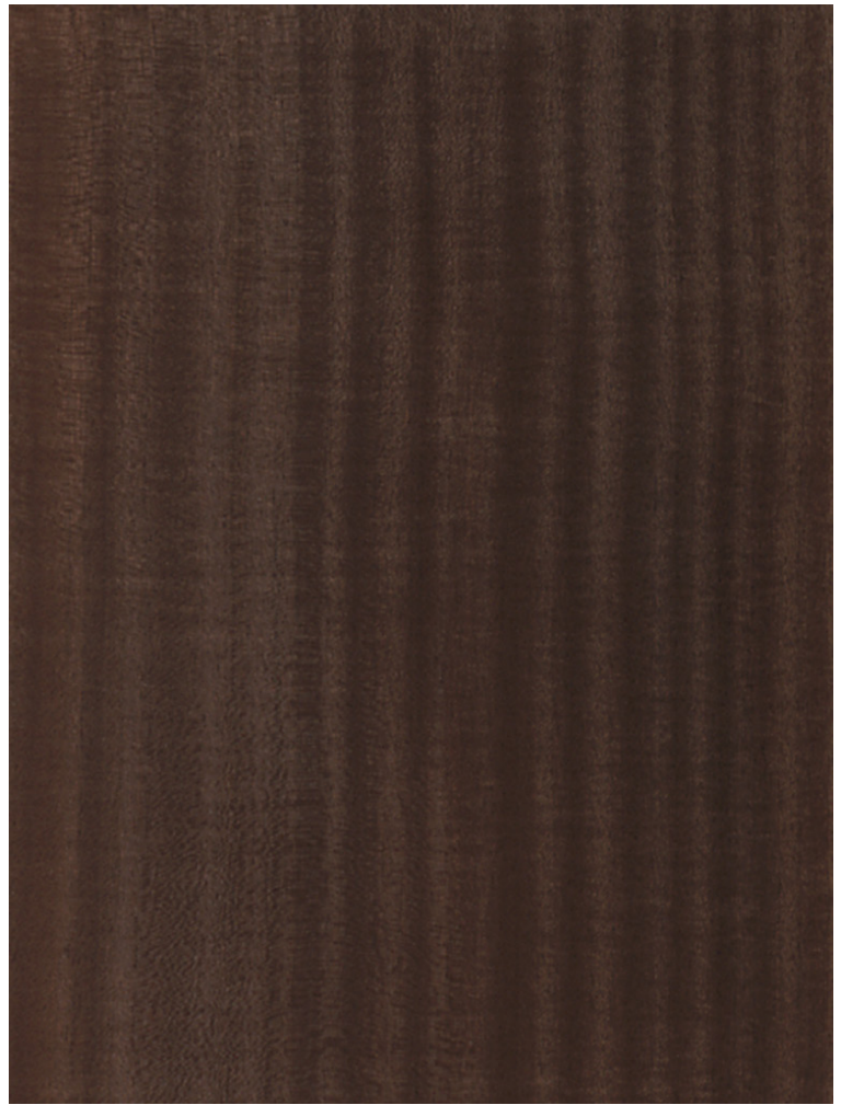
ABOVE: QUARTERED FUMED SAPELE. BELOW LEFT: SAPELE IN A SLIP MATCH. BELOW RIGHT: SAPELE IN A BOOK MATCH.