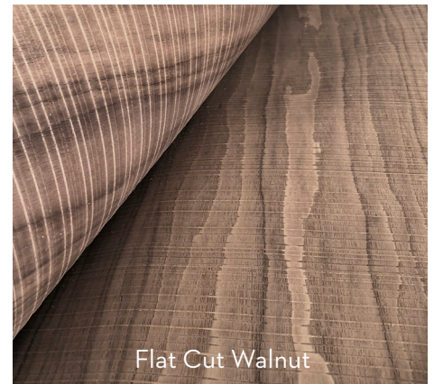
Flat Cut Walnut