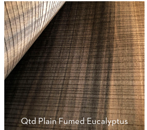
Qtd Plain Fumed Eucalyptus