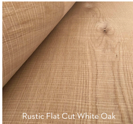
Rustic Flat Cut White Oak