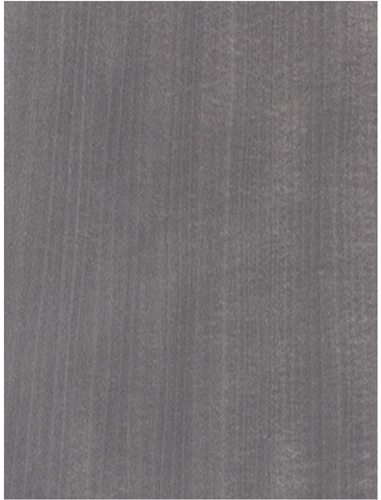
ABOVE: QUARTERED SLATE DYED POPLAR. BELOW LEFT: DYED POPLAR IN A SLIP MATCH. BELOW RIGHT: DYED POPLAR IN A BOOK MATCH.