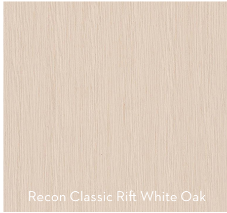
RECON CLASSIC RIFT WHITE