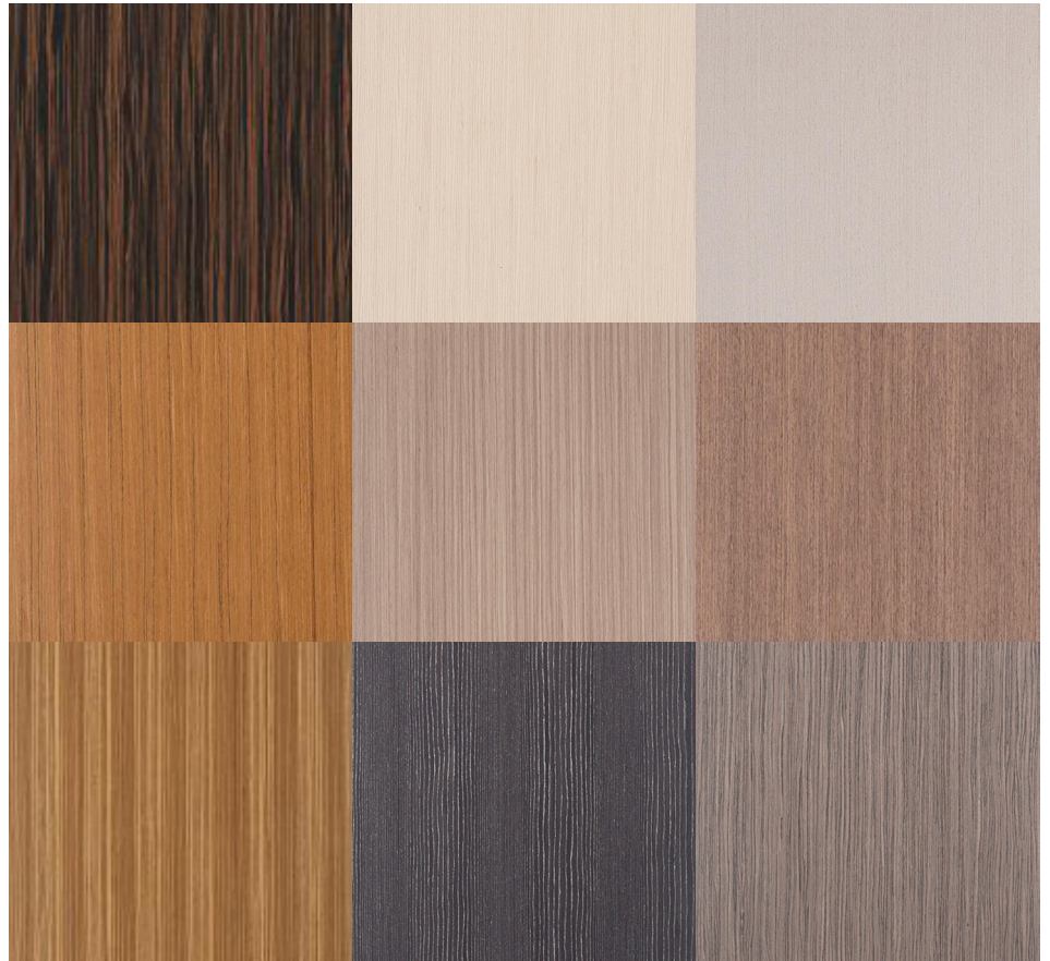
Photo images of each specie are just that, images. Actual veneers in inventory may vary depending on availability.

We have your best interests in mind with every veneer we find.