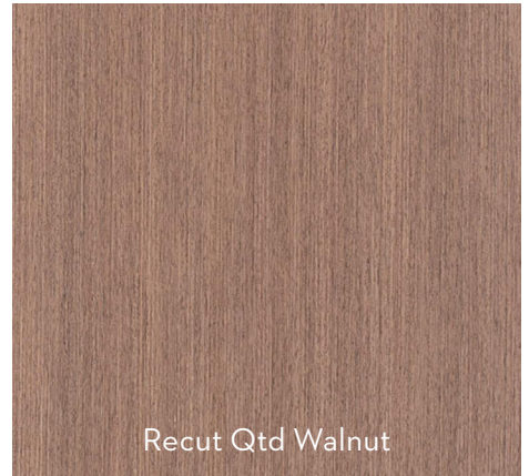
RECUT QTD WALNUT