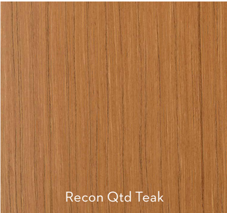
RECON QTD TEAK