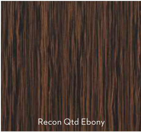
RECON QTD EBONY