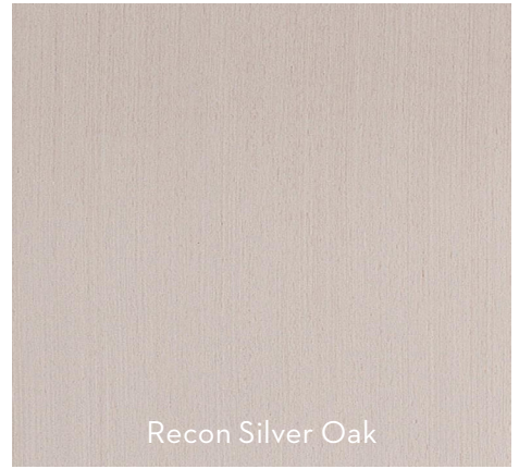
RECON SILVER OAK