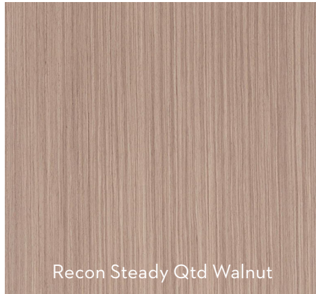
RECON STEADY QTD WALNUT