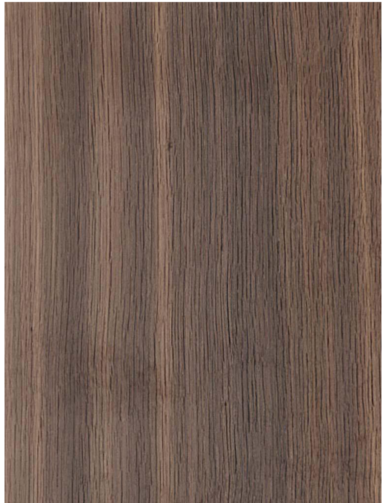
ABOVE: QUARTERED FUMED WHITE OAK. BELOW LEFT: WHITE OAK IN A SLIP MATCH. BELOW RIGHT: WHITE OAK IN A BOOK MATCH.