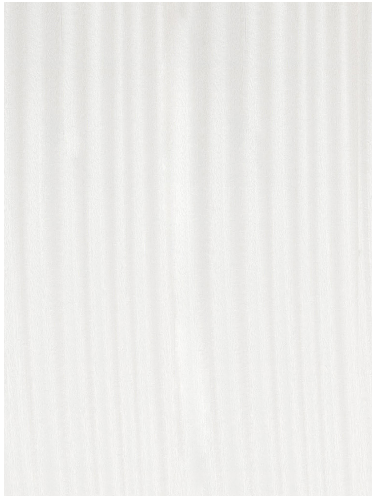
ABOVE: BLEACHED/DYED KOTO. BELOW LEFT: KOTO IN A SLIP MATCH. BELOW RIGHT: KOTO IN A BOOK MATCH.